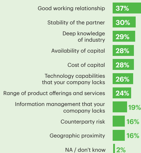
Figure 4: Most Important When Selecting Financial Partners